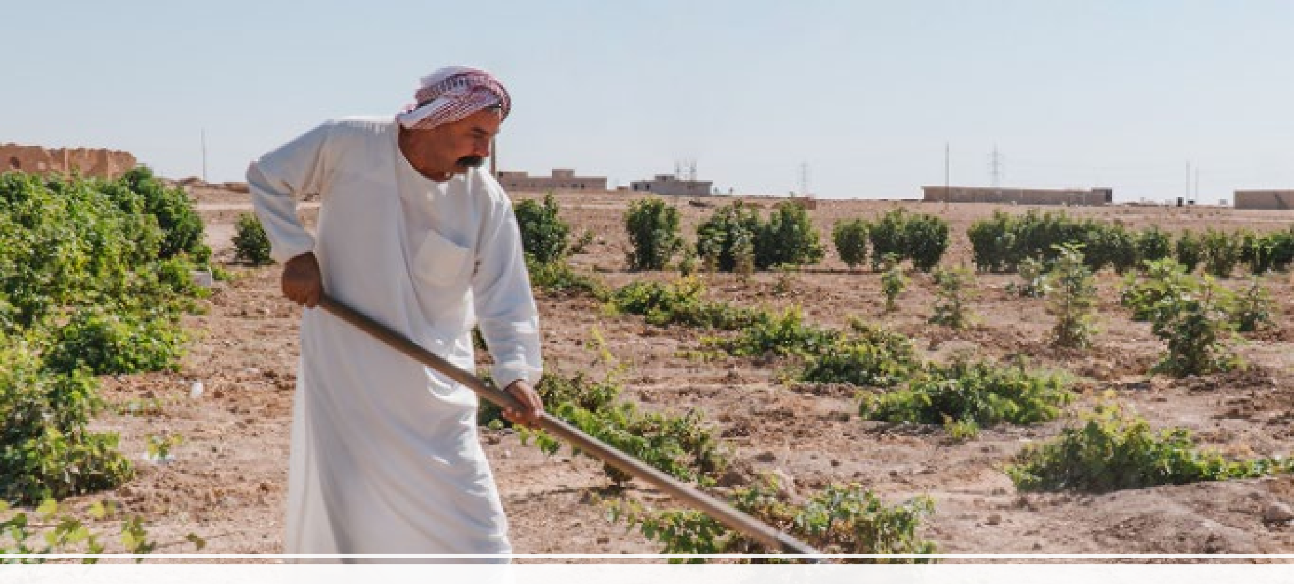
Iraq's evolving context in relation to social cohesion programming