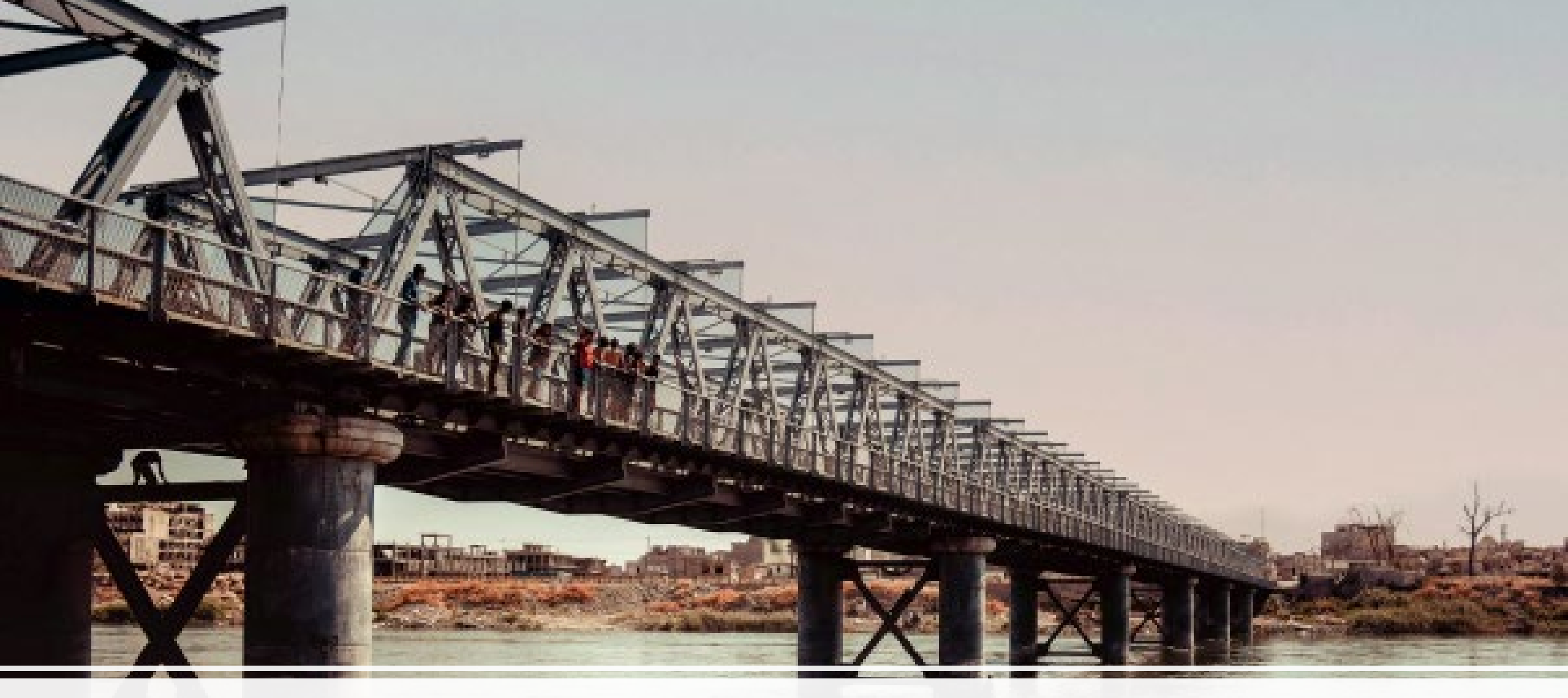
International perspectives on social cohesion support